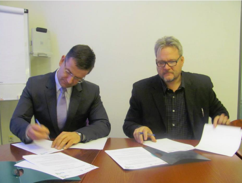
LEIF and Jokkmokk Memorandum of understanding